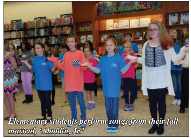
Elementary students perform songs from their fall musical, 'Aladdin, Jr.'