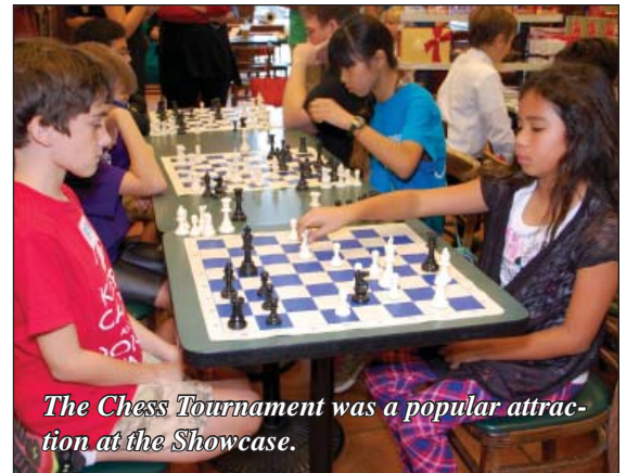
The Chess Tournament was a popular attraction at the Showcase.