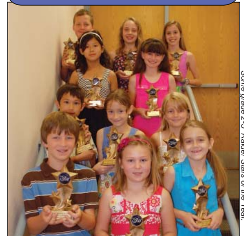
Some grade 2-5 "Raider Stars of the Year."