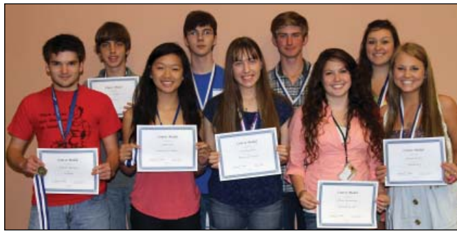
Displaying their medals and certificates are some of the high school award winners in the category of Science.