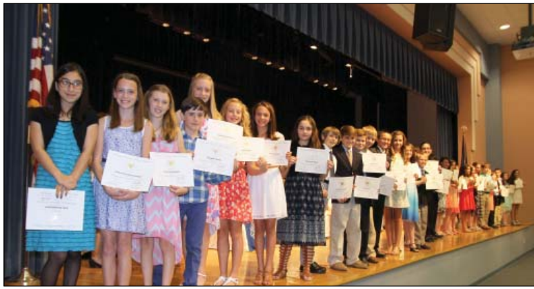
Presidential Scholars As Far as the Eye Can See ... At the Sixth-Grade Graduation, we had so many Presidential Scholars, they nearly spilled off the stage!