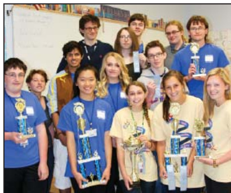
The Runnels Mu Alpha Theta members who attended the state convention display their impressive haul of trophies and medals from the event.