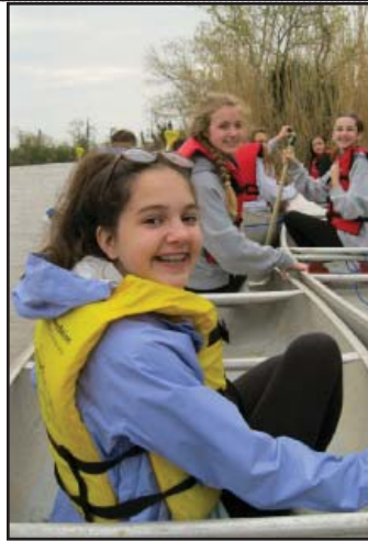
Eighth graders set sail for adventure at the Turtle Cove Environmental Research Station on their field trip in March.

room where the Louisiana Purchase was signed. At the Musee Conti Historical Wax Museum, they enjoyed viewing more than 150 life-sized wax figures representing people who have significantly impacted our state's history and culture, including Jean Lafitte the Pirate, Andrew Jackson